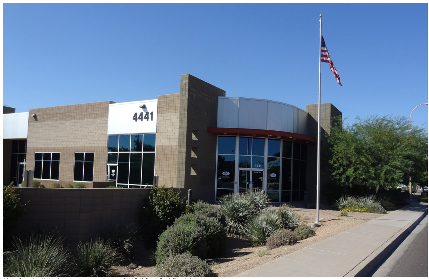
Arizona Correctional Industries new corporate headquarters 4441 E. McDowell Road, Phoenix Arizona