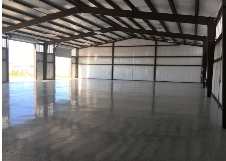
New female inmate housing located at Hickman's Family Farms