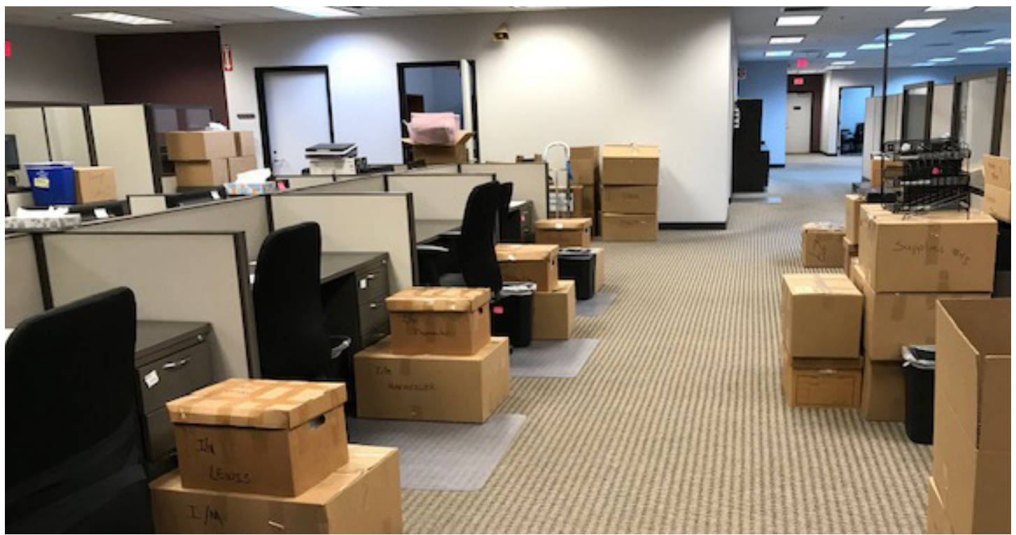
Arizona Correctional Industries' former headquarters, customer service department

By the middle of March ACI's inmate workers were not able to come out to work, and much of the staff started working from home. This has made for a challenging time of packing up the whole office in preparation for the move in September. ACI staff members deserve special thanks for coming into the office everyday to take on the challenge of starting this massive packing job.