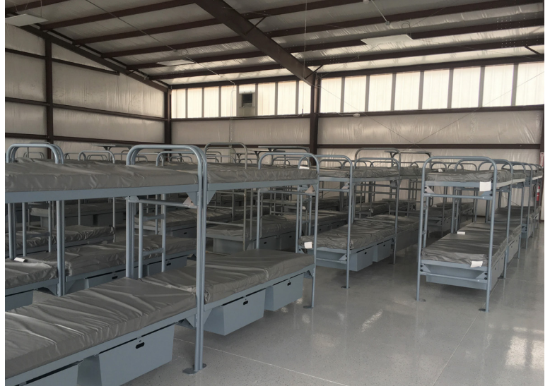
Bunk instillation at Hickman's Family Farms

"Hickman's has requested that due to its need to keep its critical operations running, it still needs the labor provided by ADCRR inmates," the letter said.